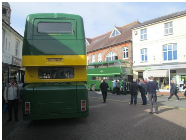
AN262 and RT3254 (plus "nutters") at Chesham; RML2412 at Amersham (Hill Avenue). Chesham Broadway seemed to cope quite well.....

For those not aware, that 'difference' mainly consisted of arrivals, departures and 'park-ups' being based on Chesham this year, due to building work on extending the car park in King George V Road, Amersham - the event's base for many years. Sadly, this meant the absence of the traditional selection of traders' stalls - a great pity but by no means completely spoiling the day. I still managed rides on six different buses, (in order: MB90, RT3254, BN45, RML2412, RT604 and RTL554), but the taking of fifty photos as well.