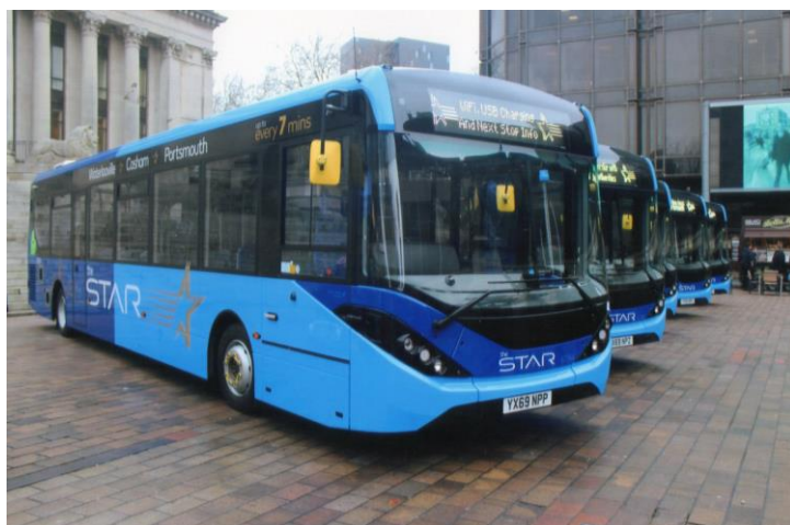
New buses on public display in Guildhall Square on 24/1/20.

level of service. Saturday 4/1/20: Normal services resumed.