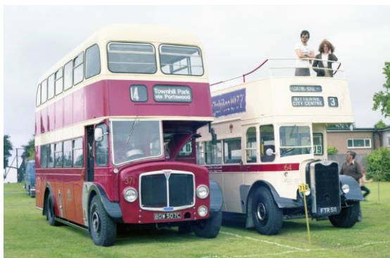
Two Southampton oldies.