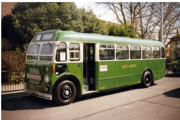
Ex Hants and Dorset 677 (KEL405) a Bristol LL6B with ECW B39R body is seen on display at Cosham on the 28 April 1996 during the Southdown/Portsmouth Running Day.