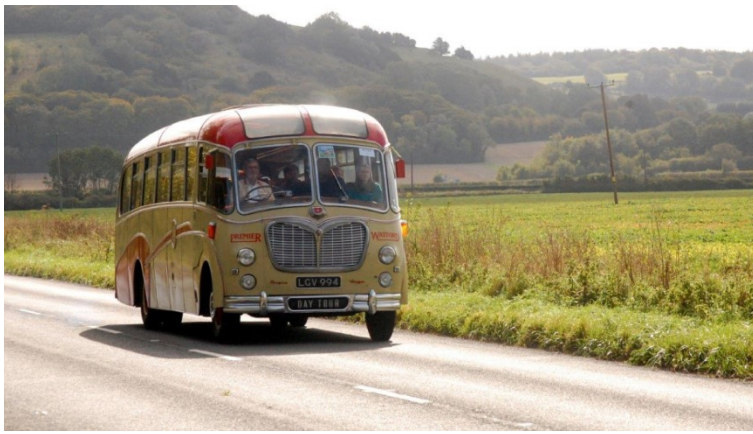
I'll take a bet that there's not a member of the SOC hasn't travelled on a coach such as this. A Bedford SB3/Duple Vega bodywork that's preserved in the livery of Premier Watford.