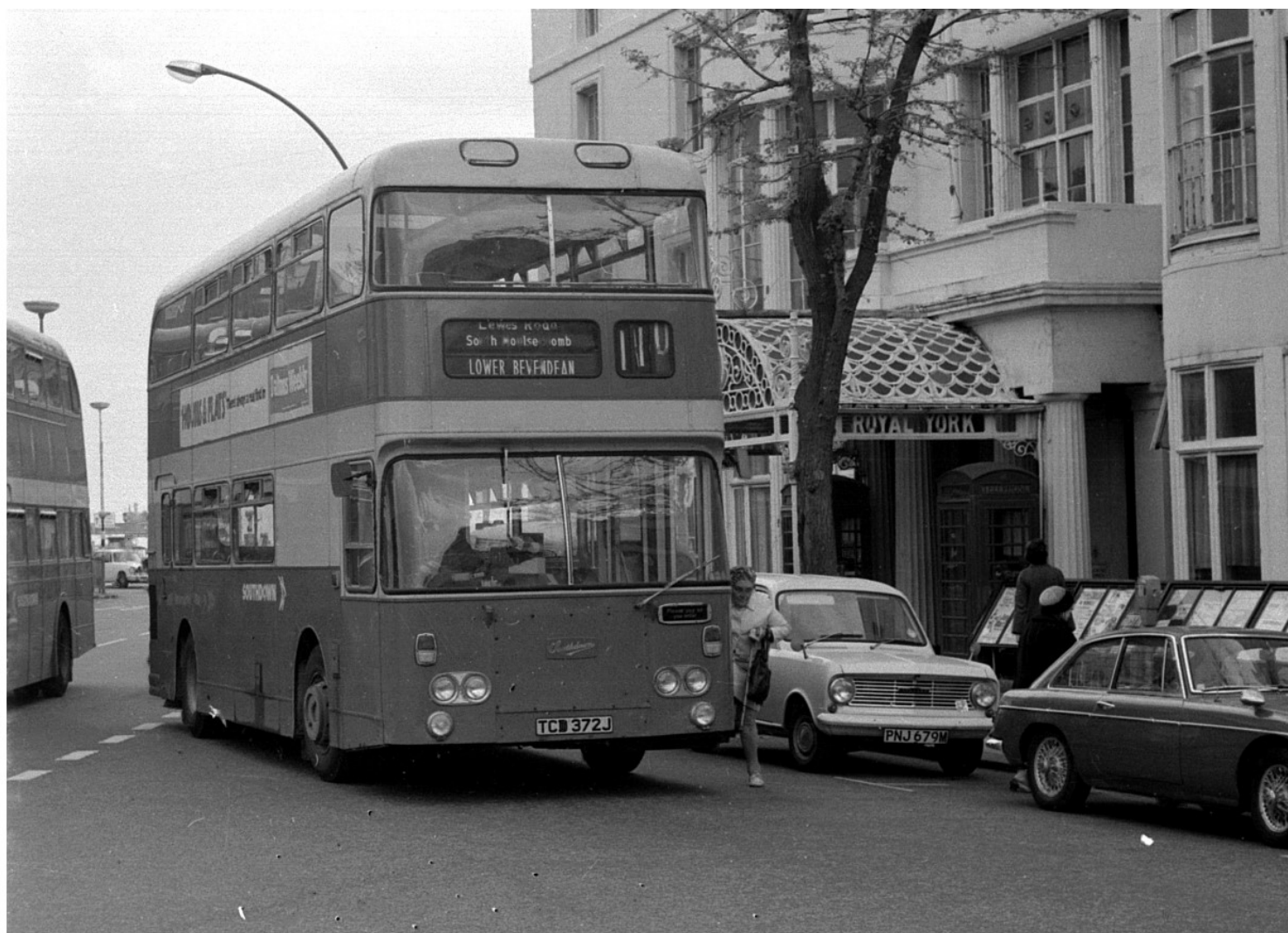
Southdown Daimler TCD 372J at Brighton 1970s "hang-on-luv, if you wait 30 years we might have low floor bus for you"