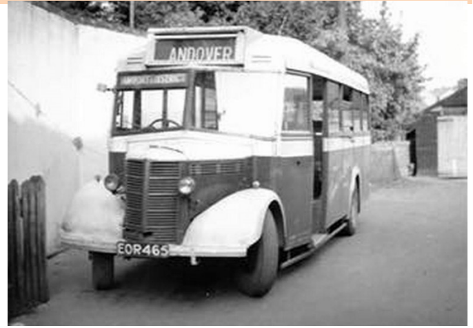
A couple of old Amport and Disrtrict Bus pictures have come my way. Both are Bedford Ob's. The first is seen in West Street, Andover. On the right EOR 465 OWB with Duple B32F body new to A&D in 1944.