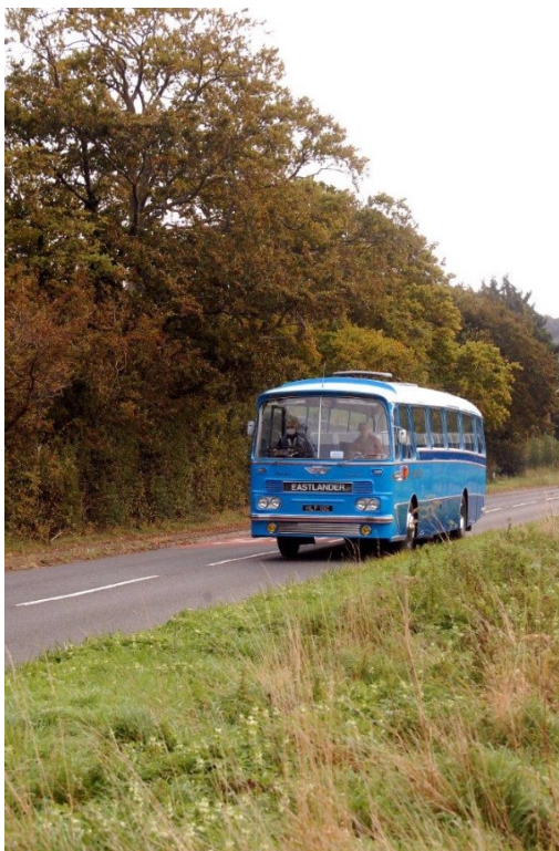
Another coach, another Premier. Premier Travel of Cambridge one used this AEC Reliance HLP10C with Harrington bodywork. I don't remember the base blue of the livery being so vivid...but memory can play tricks.