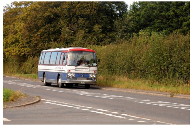
PNM757M Plaxton bodied Bedford YRQ in the colours of Great Ouse Valley Coaches.