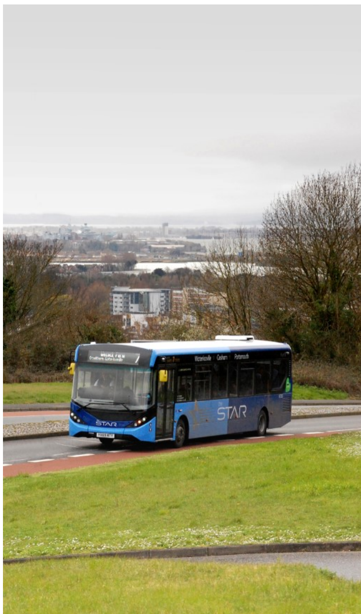
First Bus YX69 NTY, Star liveried ADL 200MMC.

Bitterne Hoppa: 23/3 service suspended. Reinstated from 6/7 to normal Mon, Wed, Fri timetable.