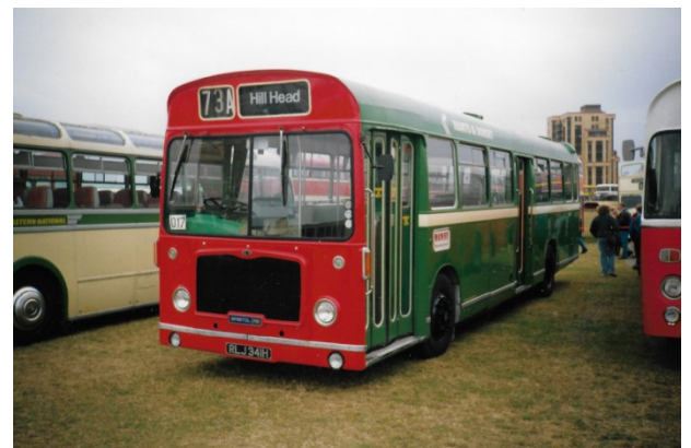
Ex Hants and Dorset 1622 (RLJ341H) a Bristol RELL6G with ECW B45D body is seen at the Southsea Spectacular on Southsea Common on the 11 June 1995.