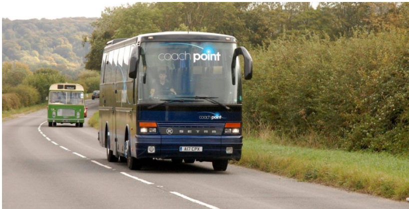
Coach Point supplied A17CPX (R762NFW) a Kassbohrer-Setra S250 Special.