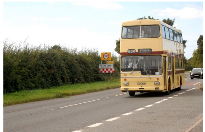
In the safe keeping of The Leicester Heritage Trust, Leicester Corporation 301 (GJF301N) a 1975 MCW Metropolitan made a splash of colour on a rapidly dulling day.