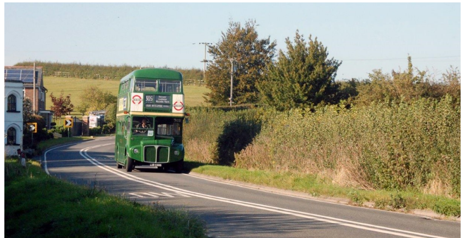
London Transport country area RML2440. I admit I get fed up with Routemasters taking over a rally but this bus was the exception. Signage and adverts have been applied in the last few years and it's exactly how I remember they were when new, a real credit to its owner.