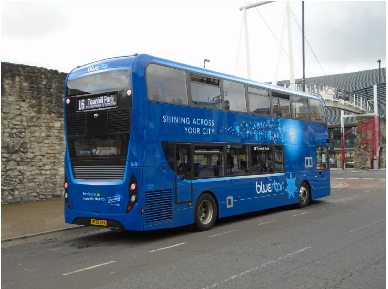
Bluestar HF20 CFN ( above ) HF20 CFO ( below ), Alexander Dennis E40D MMC, H39/32F.