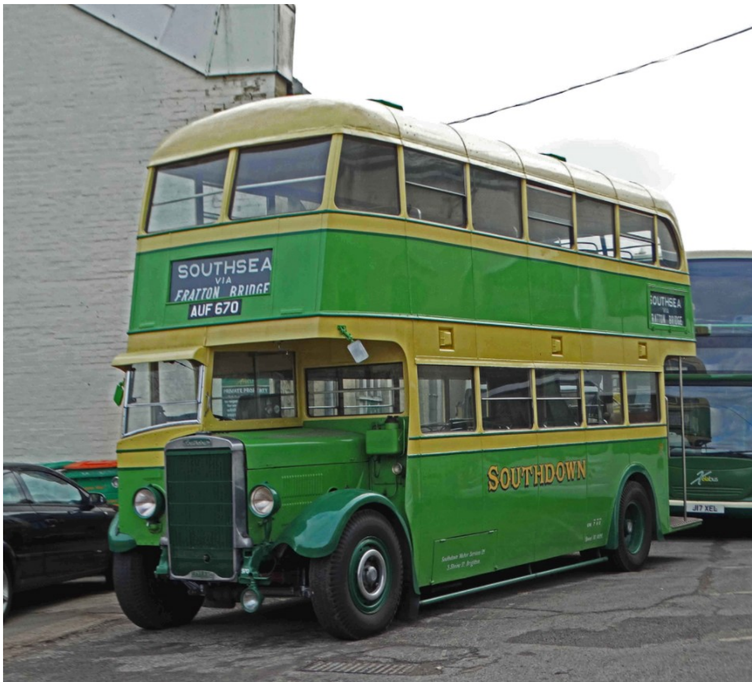
AUF 670 in the Xelabus vintage fleet.

In this edition, a full list of 2020 covid service changes and 2021 update.