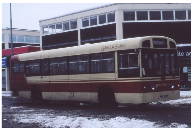
Hants & Sussex AML 570H, AEC Merlin/MCW B25D, new in 1970 as London Transport MBS570.