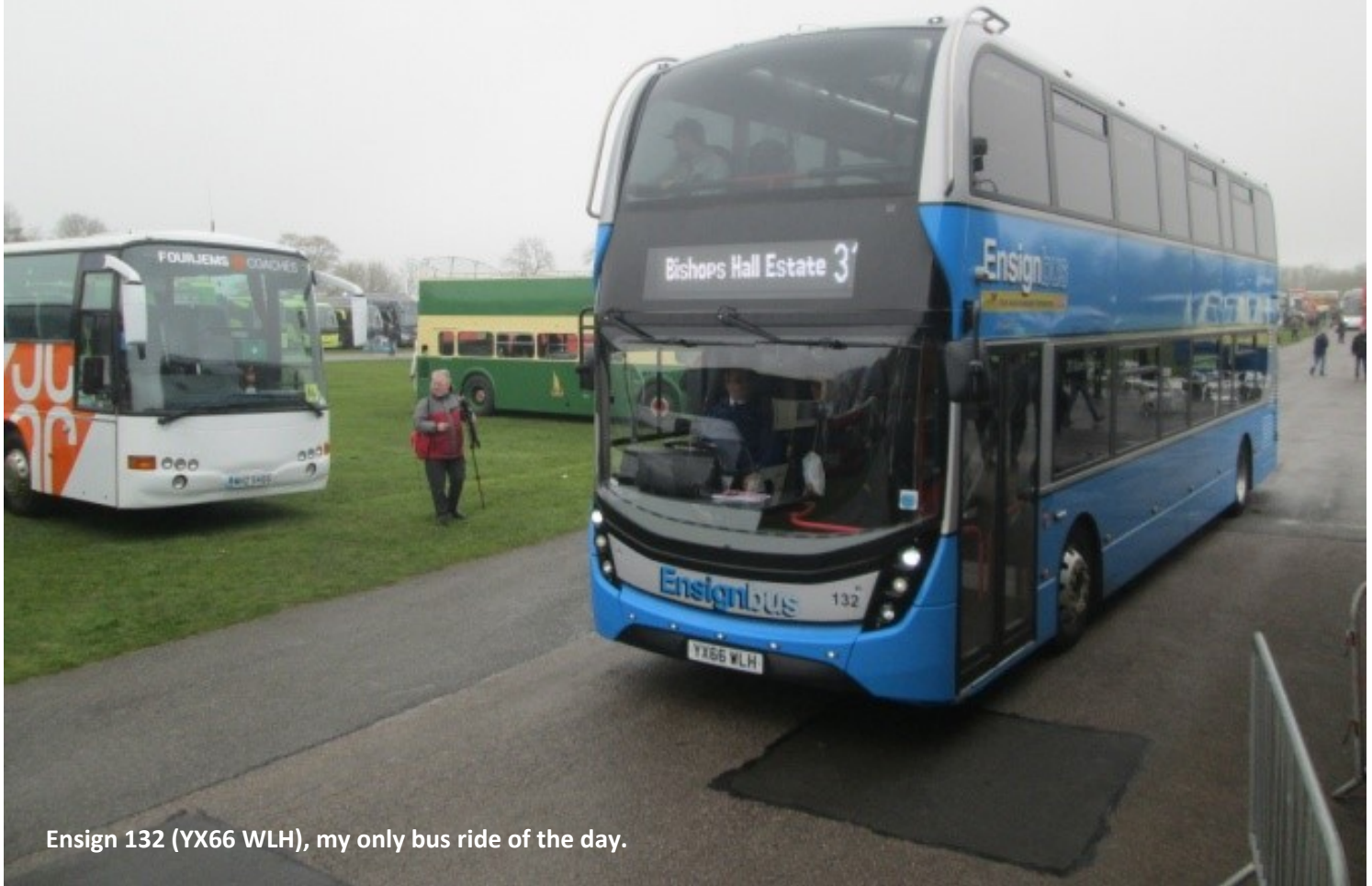
Ensign 132 (YX66 WLH), my only bus ride of the day.