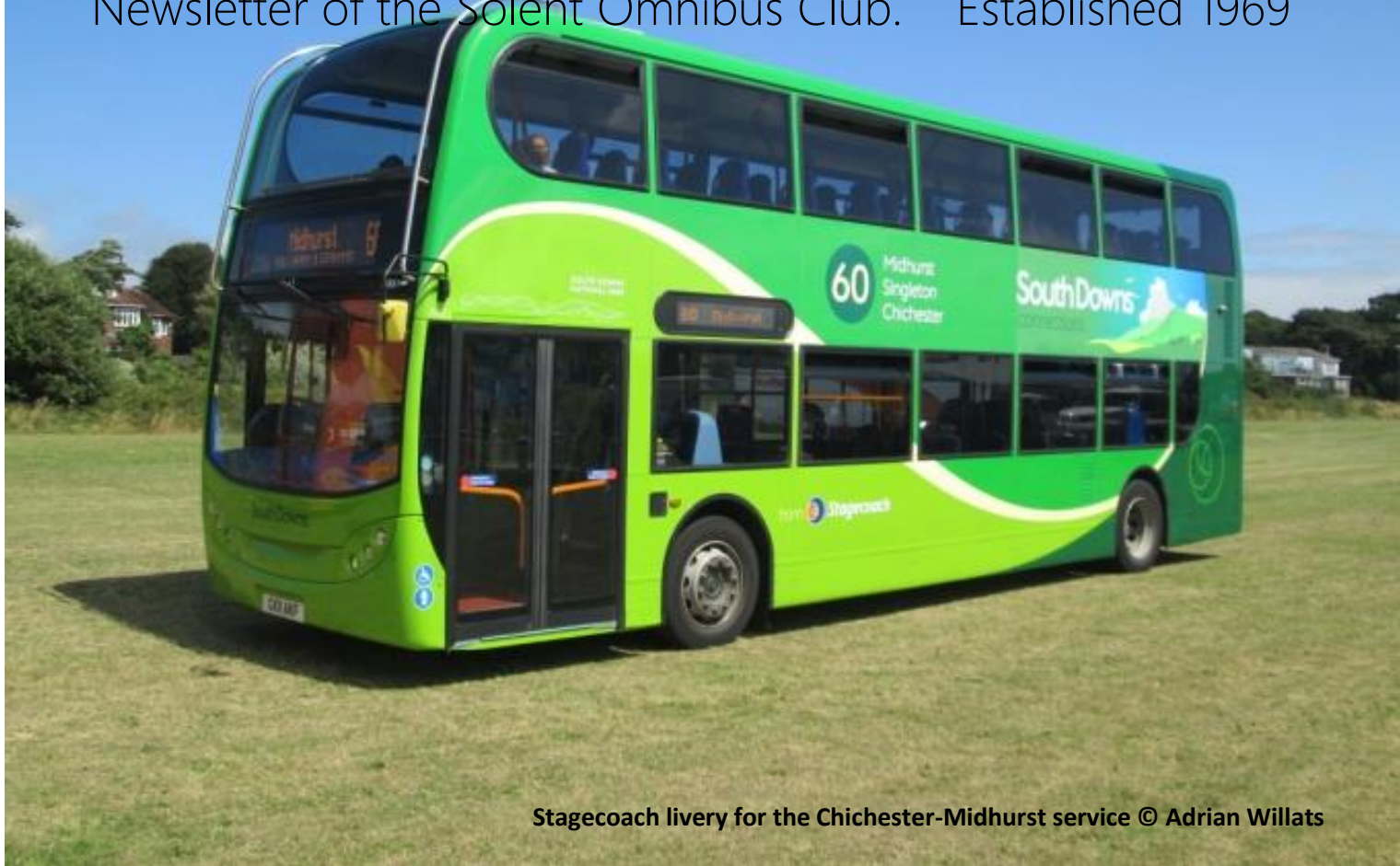
Stagecoach livery for the Chichester-Midhurst service