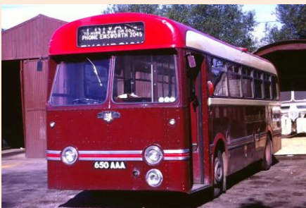
Three views of 650 AAA in Basil Williams ownership. Leyland PSUC1/2 with Weymann B43F body. John Bulman

Please Note: The Solent Omnibus Newssheet contains facts, views, opinions, statements and other content and links to external websites not controlled by the Solent Omnibus Club. The Club takes reasonable efforts to include accurate, current information but makes no warranties or representations as to the accuracy, value or safety of the published items. No liability or responsibility can be taken for errors or omissions.