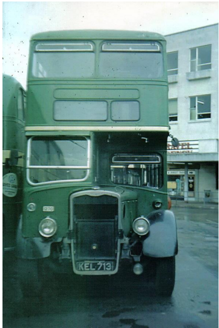
Photographs above, © Bob Gray.