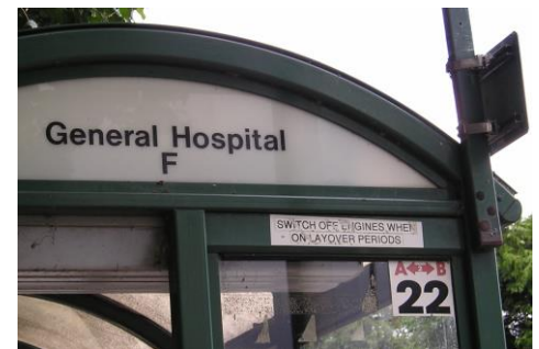
In for a long wait. A2B service 22 still on the bus stop at Southampton General Hospital.

London bus. It is an Alexander bodied Leyland Olympian, new a quarter of a century ago to what became Arriva on routes 253/4 which circumnavigate inner east and north inner London and what was once trolleybus route 653. The bus passed to the Original London Sightseeing Tour which was recently passed from Arriva to RATP (the Paris transport authority) who also own London United into whose fleet some of the remaining buses of the acquired forty buses in the batch had permeated. Al Burrito has had a kitchen fitted and the bus visits music festivals and food fairs. They hope to take on two more "giant" buses next year. I have not located where the bus is kept when not in use'