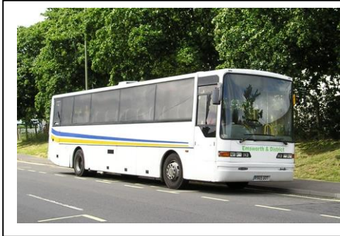
Emsworth & District R569 UOT in Eastleigh, June 2016.