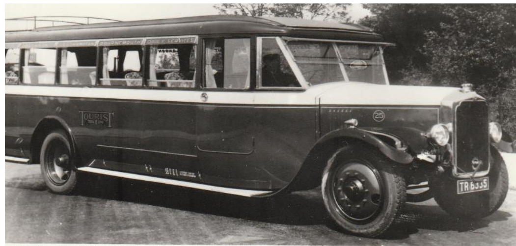
M2384 TOURIST COACHES. SOUTHAMPTON No. 25 (TR 6335) Albion 'Viking Six'

Savoy Hotel, 164, Above Bar, Southampton.